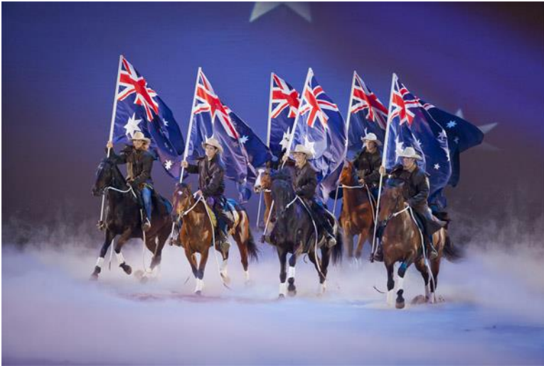
Photo from the show.